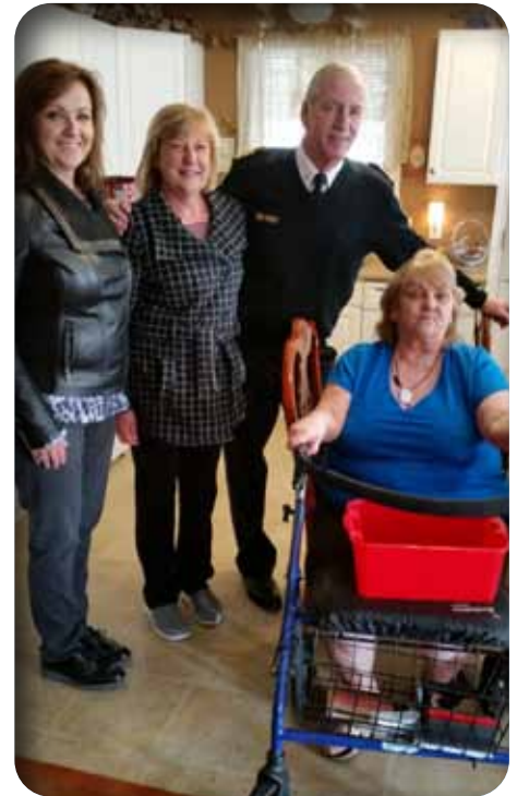
March for Meals 2018