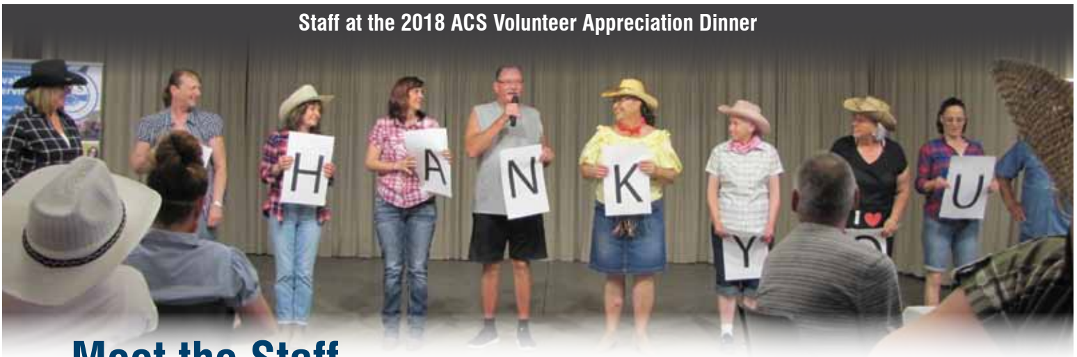
Staff at the 2018 ACS Volunteer Appreciation Dinner