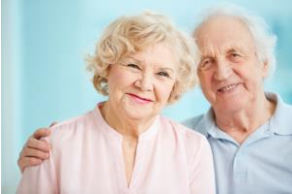
4155 Friendly Visits