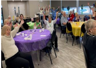
541 Congregate Dining (Feast With Friends Luncheons)

Proudly serving four communities; Amherstburg, LaSalle, Harrow and McGregor